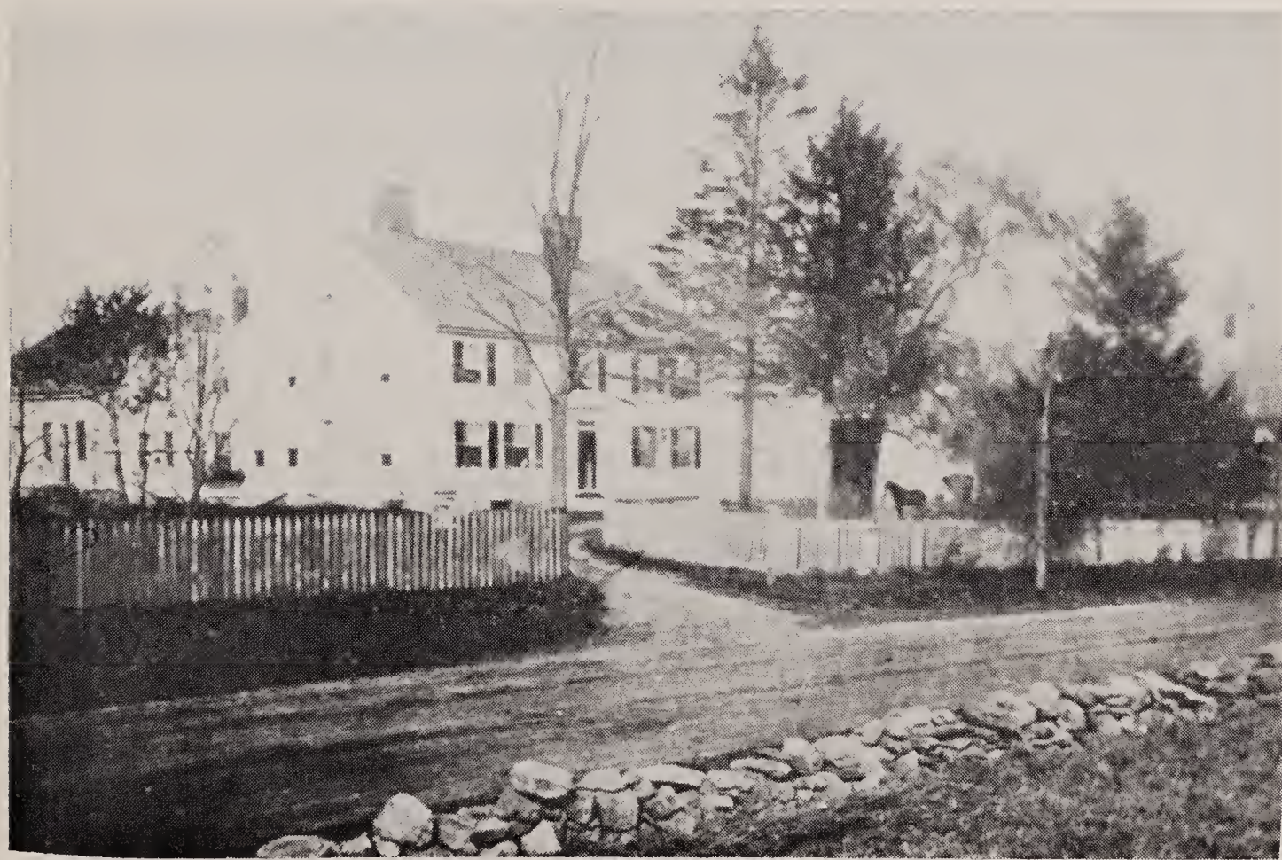
Perry Homestead on Vernon Street, Worcester, Mass. about 1875